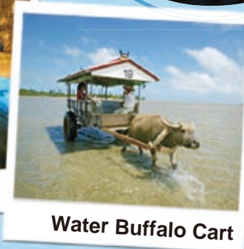
Water Buffalo Cart