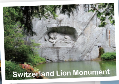
Switzerland Lion Monument