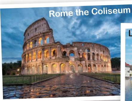
Rome the Coliseum

Incl: Tax & Fuel Charge Single Supp: $1,950