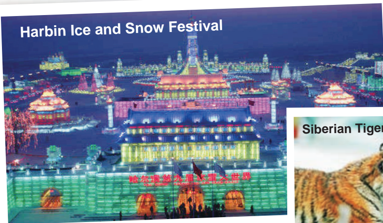
Harbin Ice and Snow Festival