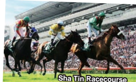
Sha Tin Racecourse