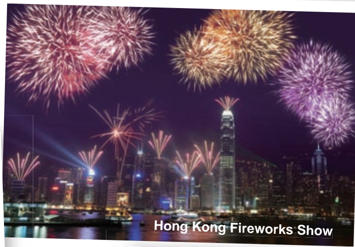
Hong Kong Fireworks Show