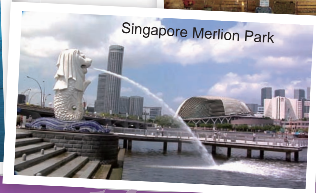
Singapore Merlion Park